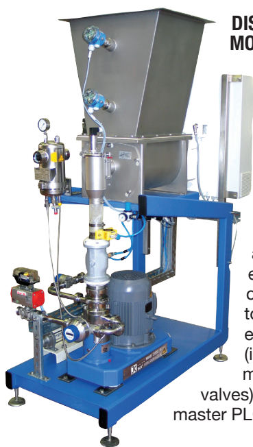
Aquafy Dispenser Skid

The SLT disperser is integrated into a skid mounted system comprising the dry polymer storage hopper and feeder, dilution water control and monitoring, and instrumentation for an installation ready, engineered package. No compressed air is required to operate the system. The entire batching system (including the mix tanks, mixers, and transfer valves) is controlled by the master PLC based control panel.